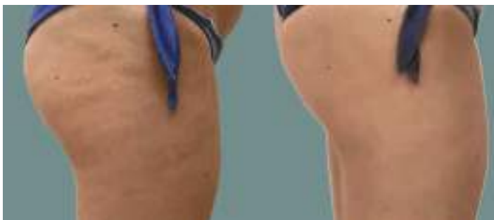
After six sessions of 30 min treatment.

Promotes firming and toning of the skin .