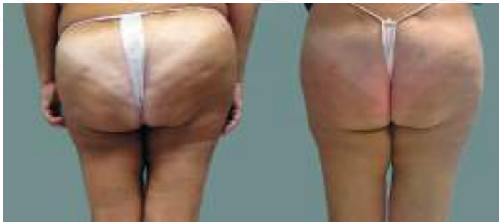
After eight sessions of 30 min treatment.

Controlled diathermic effect that speeds up the metabolism and eliminates excess fluids .