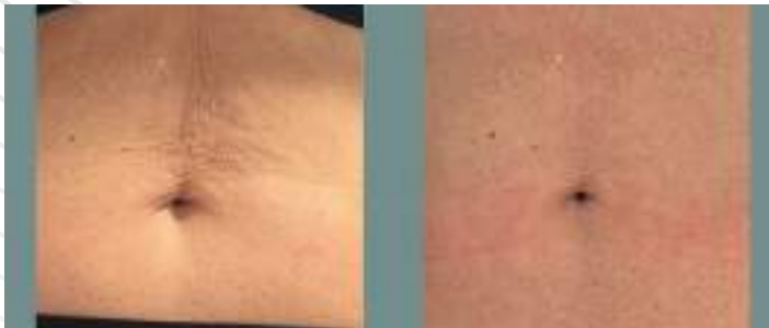
After six sessions of 30 min treatment.