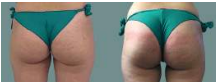
After six sessions of 30 min treatment.