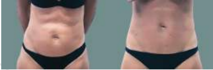
After six sessions of 30 min treatment.